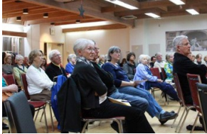
Biographies of Board Members are on our web site.