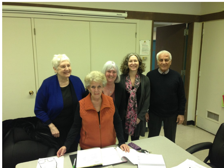
SAT Steering Committee

As usual for a non-profit, volunteers are instrumental in keeping the organization going as a thriving enterprise. Our dedicated Volunteers work on the Seniors Action Tables, on the Coalition, on the board and on committees. A very big thank you goes to these dedicated individuals.