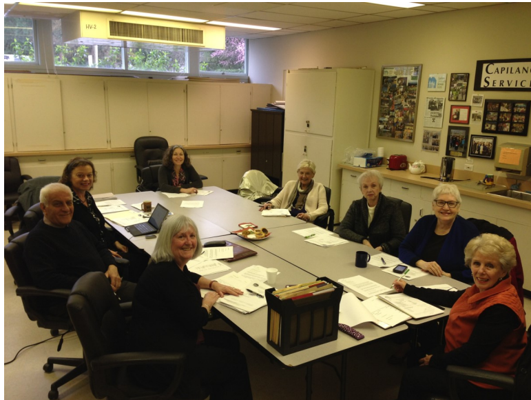
Board Meeting Spring 2016