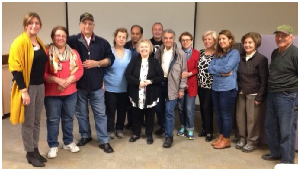
Lower Capilano SAT sponsored Computer Literacy Class

At present there are two very active SAT's, the City and the Lower Capilano SAT. They meet regularly and both have set agendas for their future work. The Seymour SAT is revitalizing itself after spending much of their energy on creating the very successful "My Parkgate Break" program. West Vancouver is not meeting but with some funding from the West Vancouver Foundation and support from Senior staff at West Vancouver Seniors Activity Centre, we are expecting to get their SAT up and running this year.